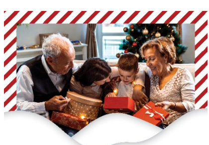
Getting vaccinated means spending more time with the ones you love this holiday season.