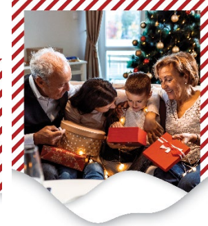
Getting vaccinated means spending more time with the ones you love this holiday season.

General Graphic 1:1 for FB/X/IG 9:16 for FB/IG story